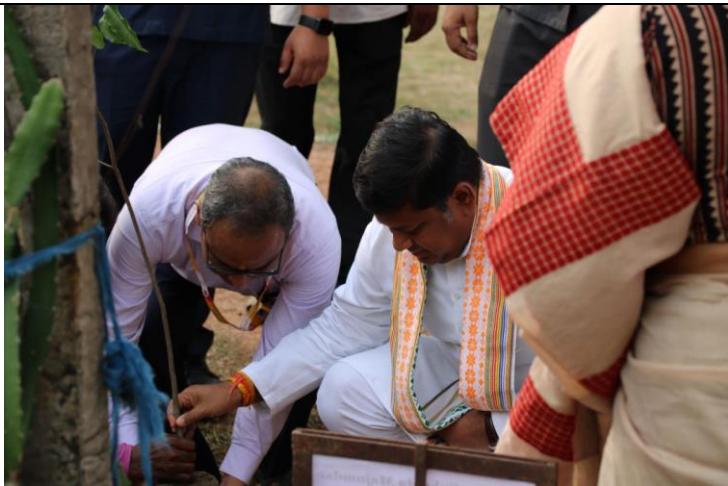
Tree Plantation by Hon'ble Minister at Rathindra KVK Campus