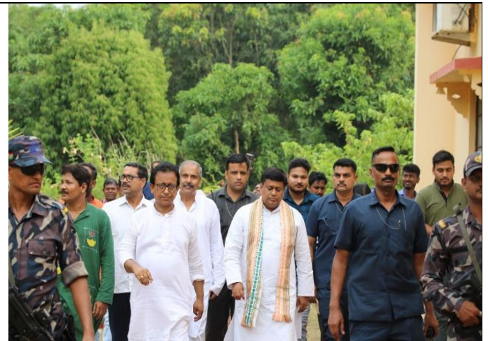
Visit of Hon'ble Minister at Rathindra KVK