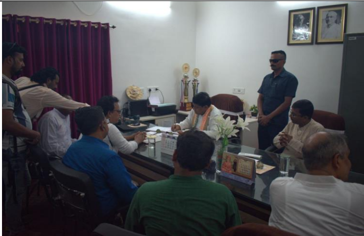
Hon'ble Minister with the Staff of the Rathindra KVK