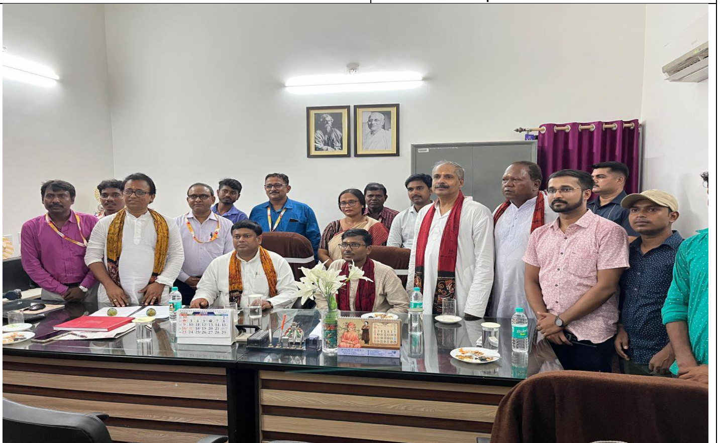
Group Photo of Staff of Rathindra KVK with Dr. Sukanta Majumdar, Hon'ble Union Minister of State in the Ministry of Education and Development of North Eastern Region, Govt. of India